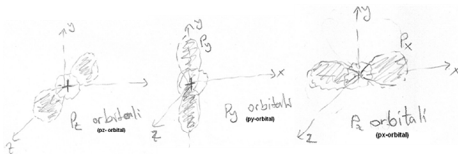
Figure 3. Advanced level students' atomic structure with s and p orbitals

As can be seen in Table 1, none of the students at the introductory level could provide a scientific explanation to the concept of spin. Eight out of sixteen advanced level students stated that the unit of spin is the Planck constant, and eight stated that it is a dimensionless magnitude.